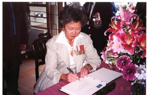
Her Excellency signing the Guest Book.