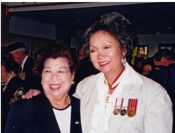
Peggy Lee and Governor-General Adrienne Clarkson