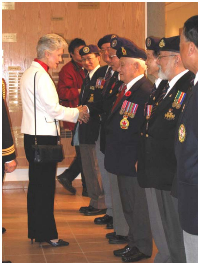
Lt. Gov. of B.C. Iona Campagnolo greets the veterans on her visit to the museum May 12, 2005, one of the many highlights of 2005. ♦