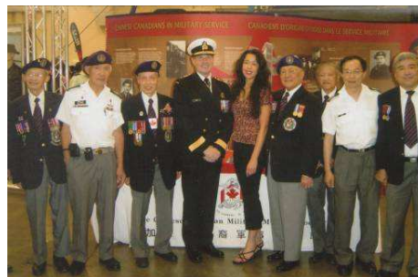
The CCMMS entourage with Rear-Admiral Tyrone Pile, Commander of Maritime Forces Pacific.