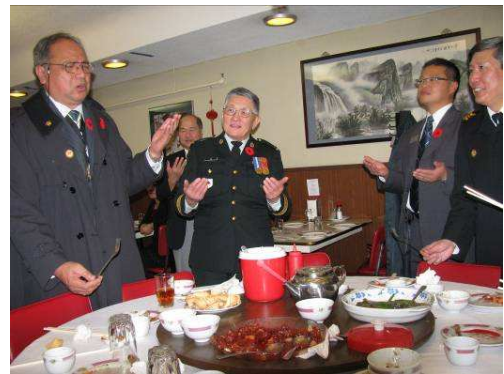
Remembrance Day luncheon with the Lt. Gov. leading special guests in a traditional Aboriginal song of thanks to the cooks at Foo's Ho Ho.