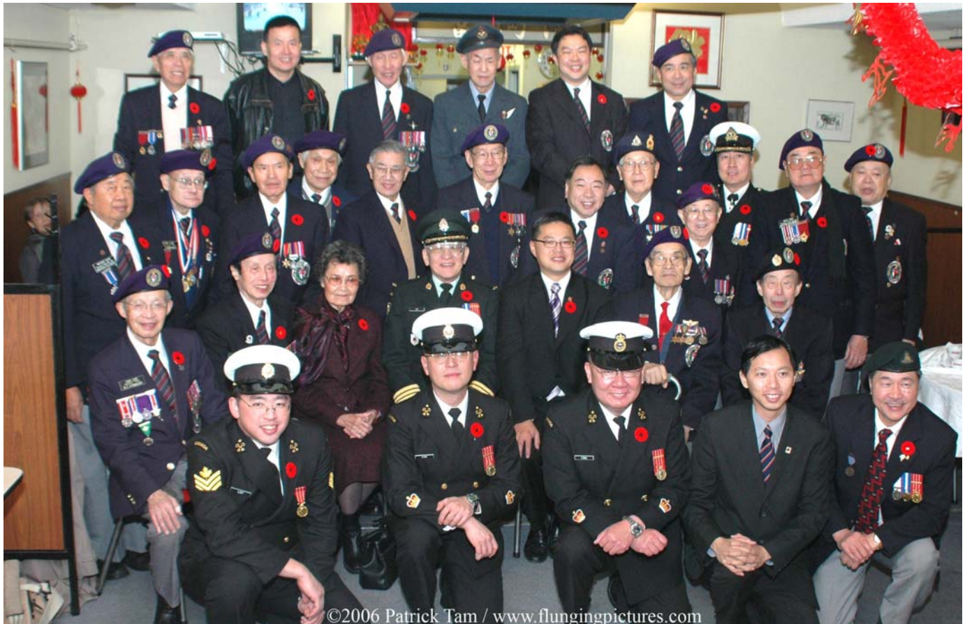
The Veterans and the Navy posed for the camera after Remembrance Day luncheon at Foo's Ho Ho

The book is available at all recruiting centres. ♦